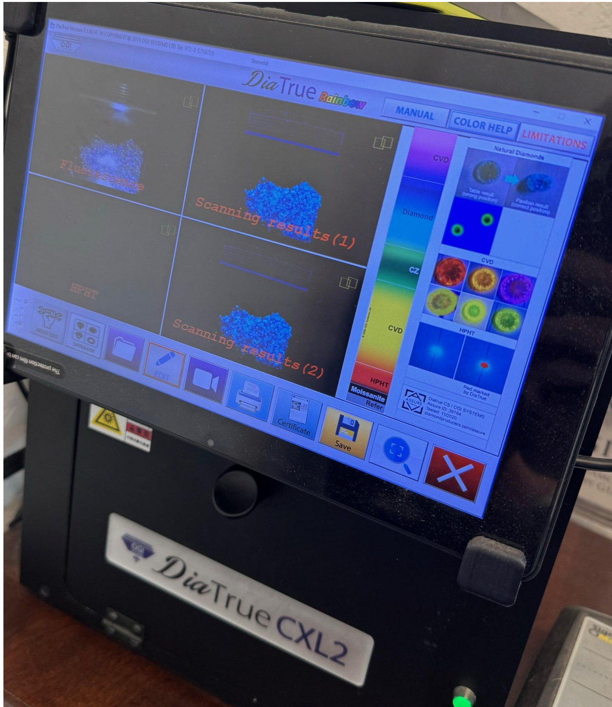
Diamond nature testing results, origin determination: Natural (earth mined)